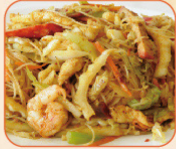
Singapore Rice Noodles