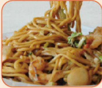
Shrimp Lo Mein