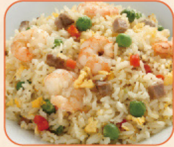
House Fried Rice